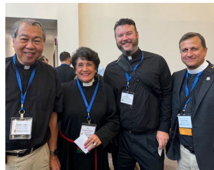
Fellow believers catching up at the ACNA Assembly in June...