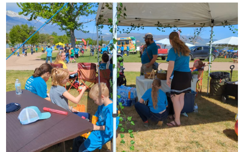
Above: Part of the team that participated in the walk.

Finally Father, I pray for all abortionists, pro-euthanasia physicians, pro-choice politicians, and all those who are gathered against us not only today but in our lives. Have mercy upon them, Father, and allow Your Holy Spirit to convict their hearts of the life destroying work that they do and bring them to repentance.