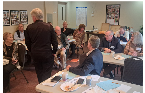
Above: Emmaus Anglican Church's Chapter leaders and members at a recent meeting.