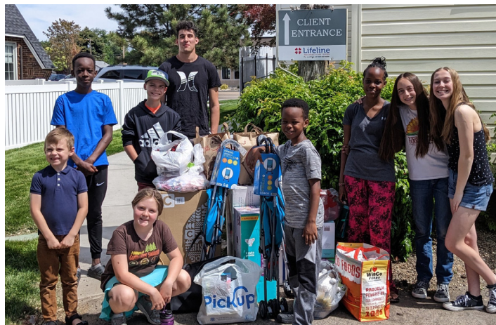
Above: Christ the Redeemer Anglican Church, Nampa, Idaho, youth drop off donations collected during the 2023 World's Largest Baby Shower.