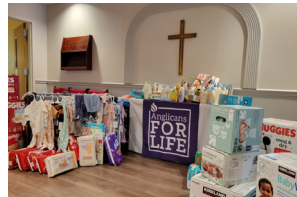
Above: Items collected at Apostles Anglican Church Knoxville, TX.