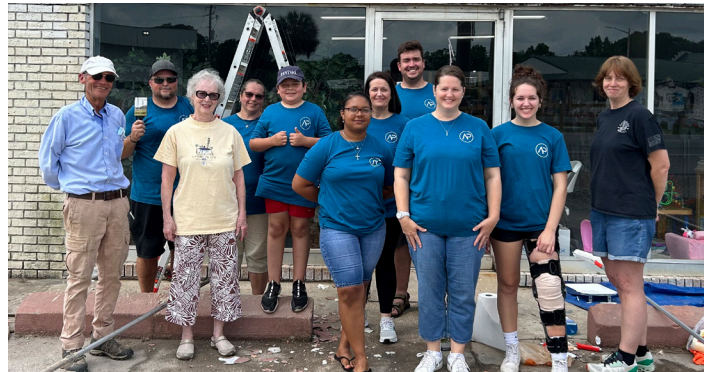
Above: The St. Francis at the Point Anglican Church Chapter standing outside the building they are renovating into a clothing closet for foster children.