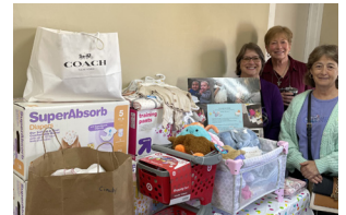
Above: Organizers pose with gifts at Christ the King Anglican Church, Poway, CA.