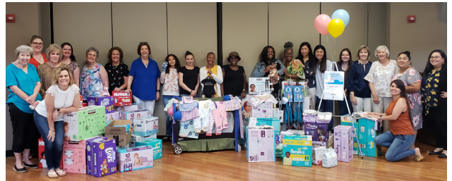
Above: Donations collected by Holy Cross Church in Sugar Land, TX

AFL is excited to announce we have already received a plethora of emails from churches participating in the World's LARGEST Baby Shower. We are humbled by the volume of donations churches have collected for local pregnancy centers or families in their congregation. This is our second year hosting this wonderful event, and we hope to continue the tradition next year. Please remember to send us photos from your shower along with an inventory of items collected. The World's Largest Baby Shower runs through the end of June.