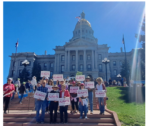
Above and below: Emmaus Anglican Church Chapter members in Castle Rock, CO participate in their state's March for Life.

As you may know, Colorado is controlled by on-demand, at-anytime-up-to-birth abortionists. We're fighting a battle to keep this extremist position out of the state constitution. Frankly, it may be an uphill struggle, but we're never giving up! Being at the March For Life with so many of our fellow Pro-Life Coloradans was uplifting, encouraging and inspiring for our Emmaus group. We'll be back next year!