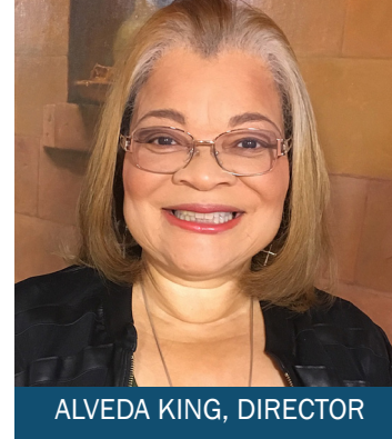
OF CIVIL RIGHTS FOR THE UNBORN, PRIESTS FOR LIFE & FOUNDER OF ALVEDA KING