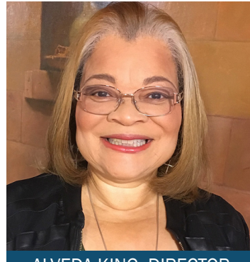
ALVEDA KING, DIRECTOR OF CIVIL RIGHTS FOR THE UNBORN, PRIESTS FOR LIFE & FOUNDER OF ALVEDA KING MINISTRIES