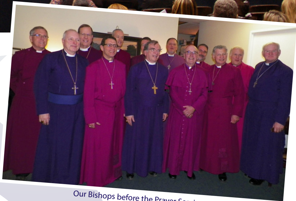
Our Bishops before the Prayer Service.