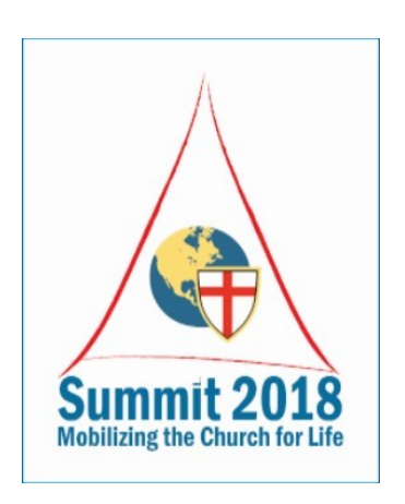
Speaker and Workshop Videos are now online!