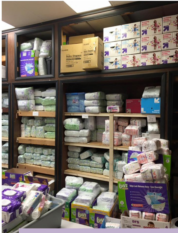
Above: Full shelves from full hearts! The Diaper Pantry has distributed 100,000 diapers since February 2014. Below: The Pantry also collects children’s toys, clothing, baby food, and other necessary items for families.