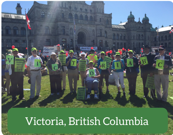
Victoria, British Columbia

Some of the co-coordinators shared some of their experiences from the day of the March: