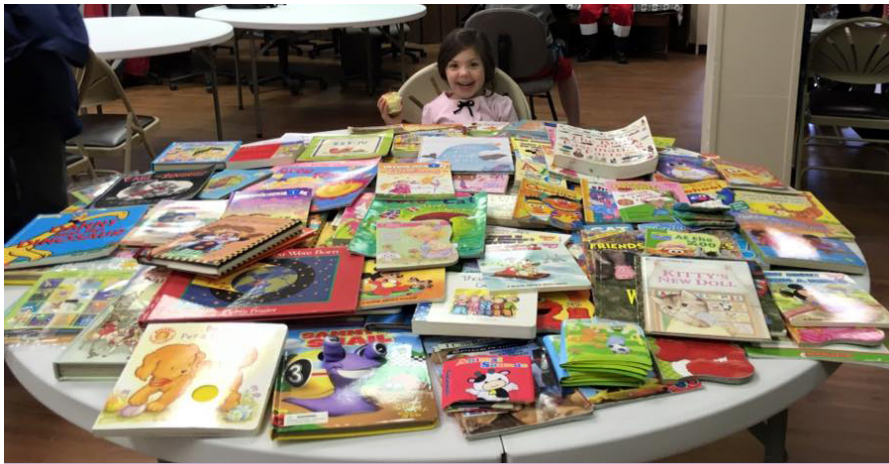
One of the youngest (and most excited) volunteers at the Diaper Pantry!

“It was really a God moment,” she shared, “I normally don’t talk in vestry meetings, but God told me to speak up and so I looked into it. I just couldn’t imagine, being a mother myself, not having diapers for my children.” The Christ the Redeemer Church now runs the only Diaper Pantry in Washington County.